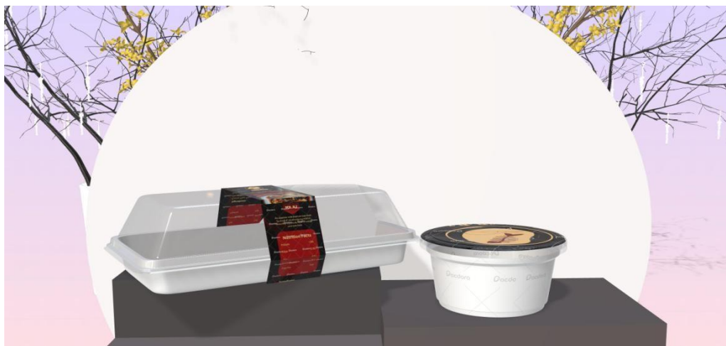
Figure 4. The final layout of the packaging