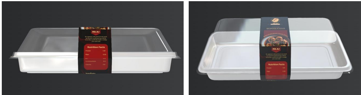
Figure 1. The front and back of the packaging

Prepare the shaomai for packaging; then prepare the transparent box; make sure the transparent box is clean and dry to make the shaomai away from bacteria and safe to consume; once ensured that the box is clean and dry carefully place the milkfish bone shaomai; each box should contain 6 shaomai; put the chili-garlic sauce in a 3 oz hinge cup; carefully close the box to ensure that the product were not contaminated; seal the product to ensure product quality Once the product is ready and sealed, you can deliver it to your customer.