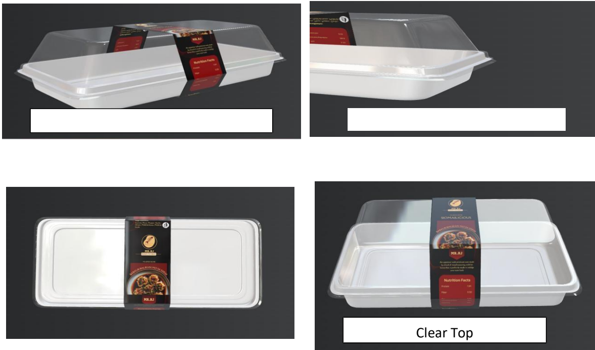
Figure 2. The features of the packaging